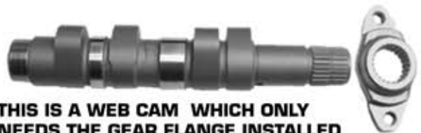
THIS IS A WEB CAM WHICH ONLY NEEDS THE GEAR FLANGE INSTALLED (ONLY 2 PIN HOLES ARE LEFT OPEN. DO NOT INSTALL THE PINS)

REMOVE THE SPRING AND PIN FROM THE HEAD, AS THEY ARE NOT NEEDED. DO NOT PLUG THE HOLE.