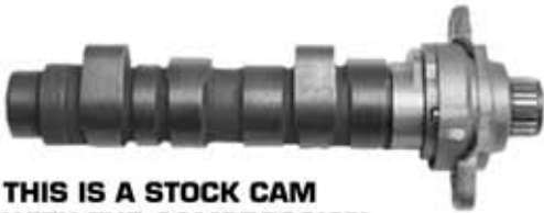
THIS IS A STOCK CAM WITH THE COMPRESSION RELEASE INSTALLED

IF YOU HAVE ANY QUESTIONS, PLEASE DO NOT HESITATE TO CALL WEB-CAM @ 951.369.5144.